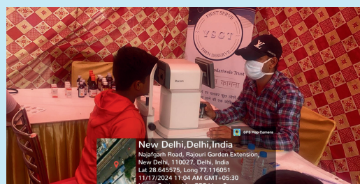
A Health Camp was organised at Slums, Tagore Garden with support from Rotary Club of Delhi West