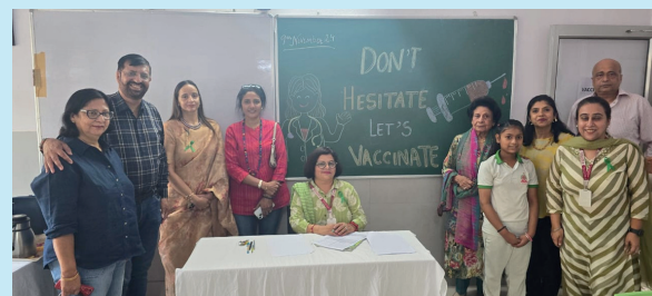
Rotary Club of Delhi West organised the 2nd dose of Cervical Cancer Vaccination for 170 girls at RCDW Interact Club, Shaheed Bishen Singh Memorial School, Mansarovar Garden, Medical Support was facilitated by Apollo Hospitals.