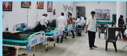
Rotary Club of Delhi West in association with Shroff Charitable Eye Hospital organised a Mega Eye Camp with free Cataract Surgeries at Gurudwara, GK 2 for the benefit of a large number of Residents. Delhi Minister Sh Saurabh Bhardwaj graced the occasion. More than 200 Residents are expected to benefit from the facilities.