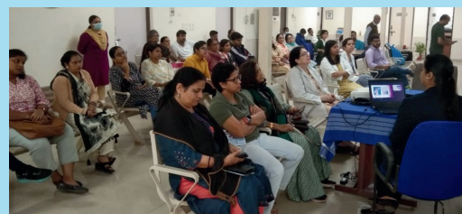
Rotary Club of Delhi West and Rotary Club of Delhi Inspire organised a Cancer Awareness and Detection Camp with Mammography at IIT, Delhi. There was an Awareness Talk by a Senior Oncologist, attended by a large number of audience.